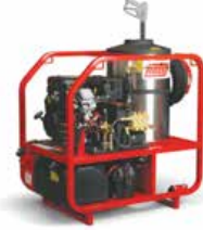
Model 1080BE 4.6 GPM @ 3500 PSI; Briggs Vanguard gas engine (shown with optional stainless steel coil wrap and skid rails)