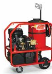
Model 1075BE 4.0 GPM @ 3500 PSI; GX390 Honda gas engine (shown with optional caster kit)